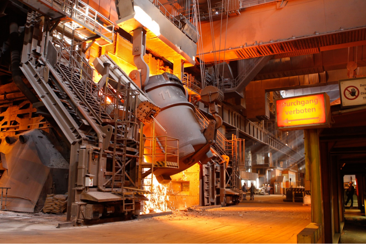
Steel plant: Oxygen converter