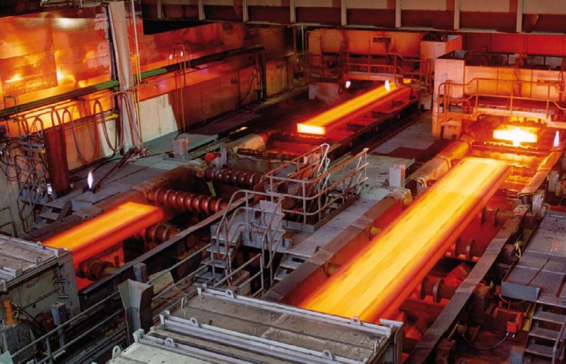
Steel plant: Slab continuous casting plant