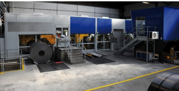
Cold rolling mill: Quarto reversing cold rolling plant

The aim of this brochure is to explain the causes and possibilities for avoiding and detecting residual defects. Moreover it points out the existence of the residual risk of defects in semifinished products of steel such as cold rolled steel strip.