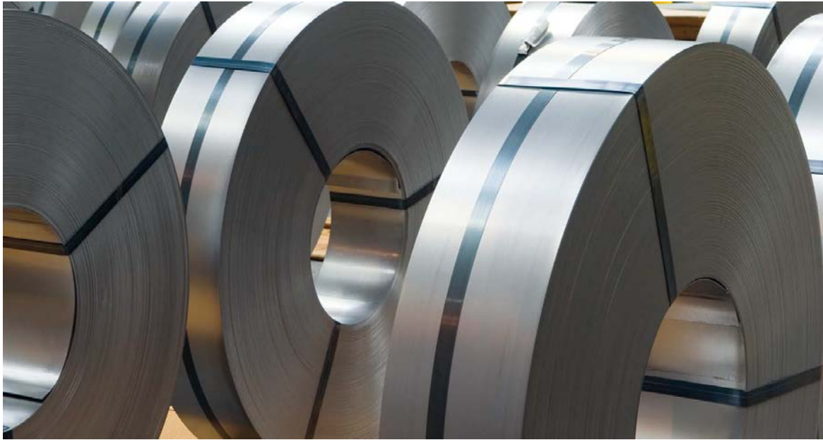
Cold rolling mill: Ready-to-despatch cold-rolled steel strip