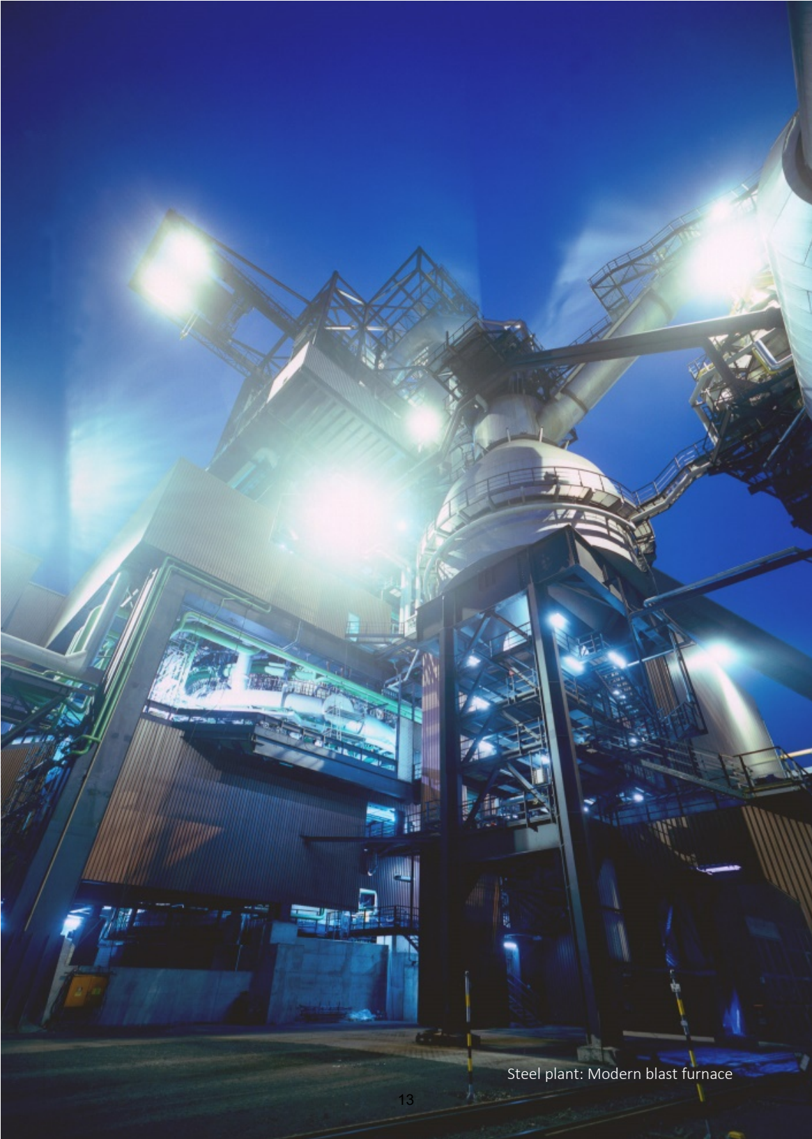
Steel plant: Modern blast furnace