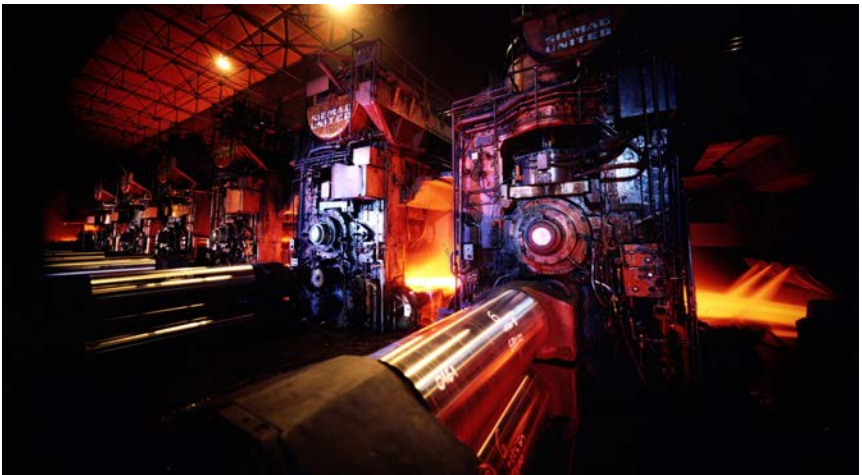
Hot rolling mill: Multiple-stand finishing group

In addition any damaged or jammed transport roller in the roller table may result in damage to the hot, and hence sensitive, pre-strip, which will subsequently become conspicuous in the form of scabs.