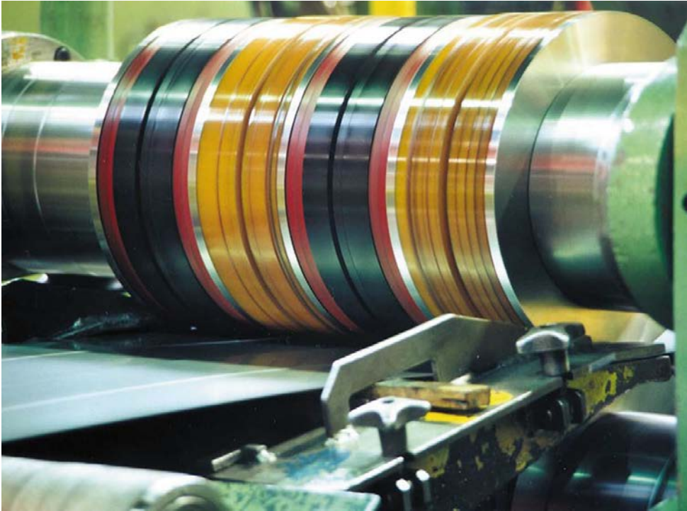
Cold rolling mill: Cold-rolled strip slitting line