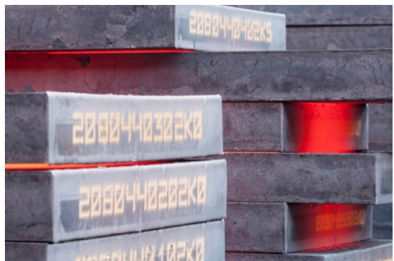
Steel plant: Slab stock

Despite all inspections during the steel production, a residual risk remains, which can only be excluded by a 100% inspection of the parts after processing or finishing.