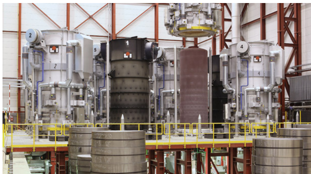
CR mill: H 2 -high-convection batch annealing furnace